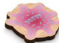
MBDG11 Round: Ø30 x 3mm.