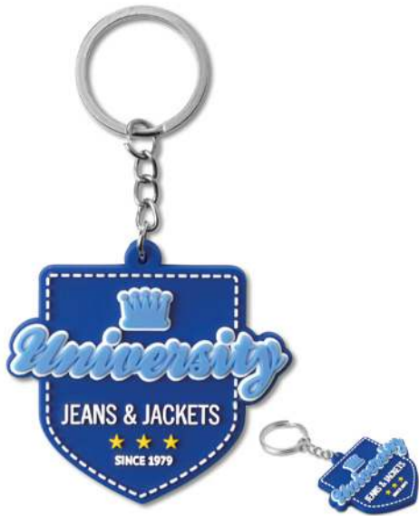
MK1001 2D PVC with design on 1 side.