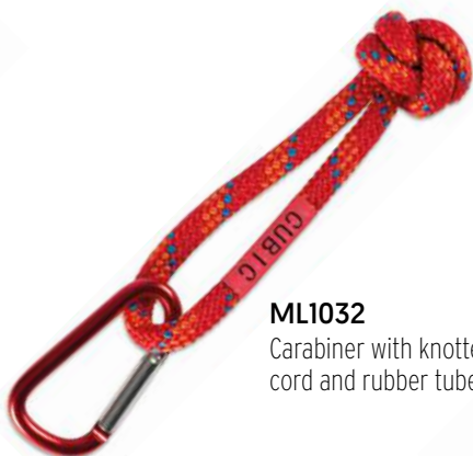
ML1032 Carabiner with knotted cord and rubber tube.