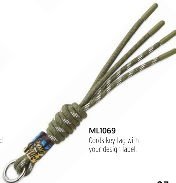
ML1069 Cords key tag with your design label.