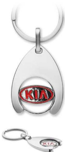
MK4010 Claw shape.