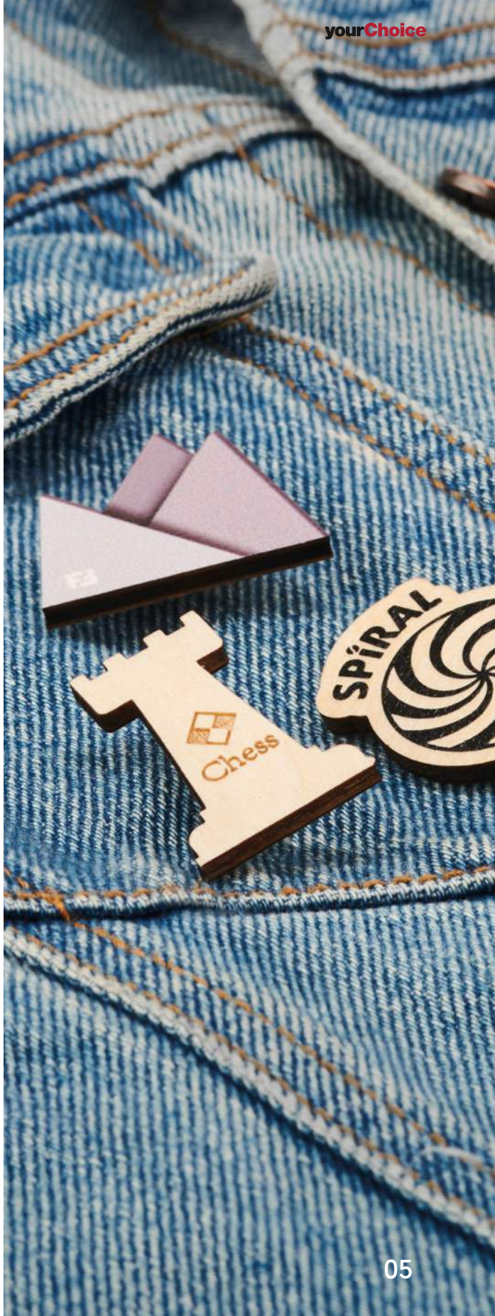
MBDG04 Custom: within 30x30x3mm.