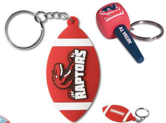
MK1003 3D PVC custom shape.