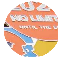
Imitation Hard enamel