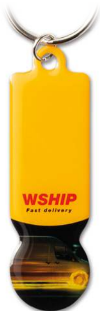
MK4009 Full colour, standard shape.