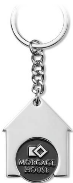
MK4001 Heart shape holder.