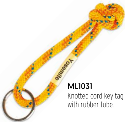
ML1031 Knotted cord key tag with rubber tube.