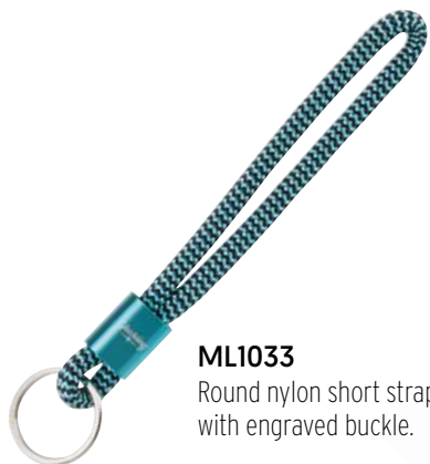
ML1033 Round nylon short strap with engraved buckle.