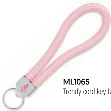
ML1065 Trendy cord key tag.