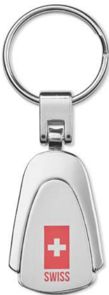
MK2011 Special design key chain.