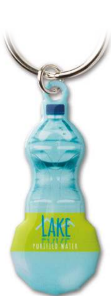
MK4009 Full colour, standard shape.