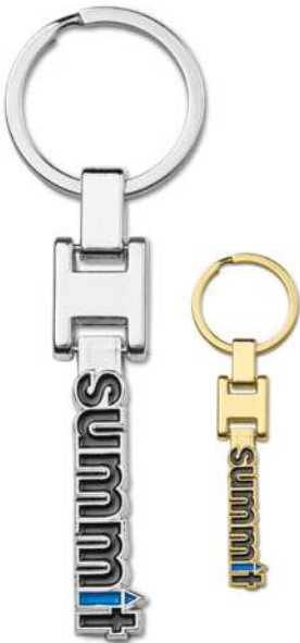
MK2009 Zinc alloy. With swing mechanism and soft enamel (recessed surface).

○ ● ● ● ● ● ● ● ● ● ● ● ● ● ● PU Leather standard colours