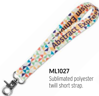
ML1027 Sublimated polyester twill short strap.