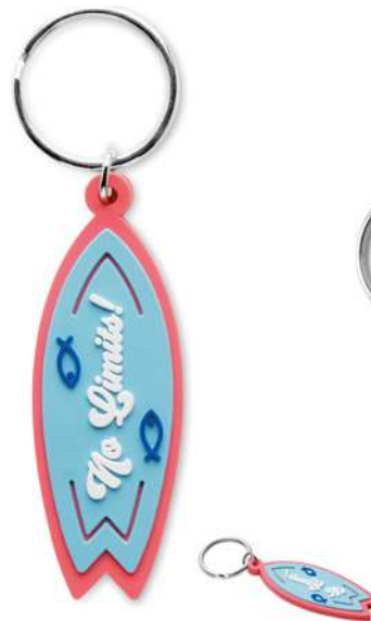
MK1002 2D PVC with design on 2 sides.