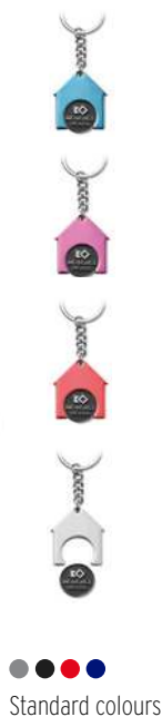
● ● ● ● ● Standard colours